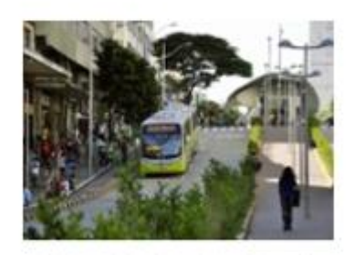
Belo Horizonte, Brazil

Belo Horizonte, situated in the state of Minas Gerais in the south-eastern region of Brazil, is one of Brazil's most populous cities with around 5 million inhabitants.